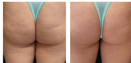
DIAMOND ADVANCED AESTHETICS, NYC