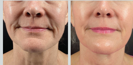
ESMÉ THE MEDSPA