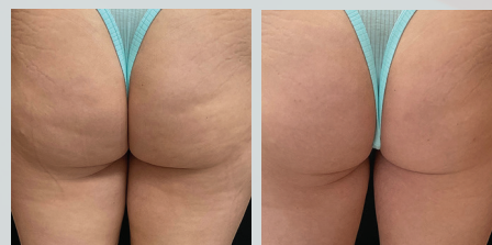
DIAMOND ADVANCED AESTHETICS, NYC